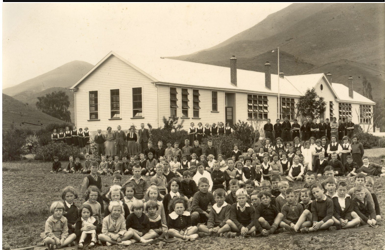
KUROW SCHOOL 1939