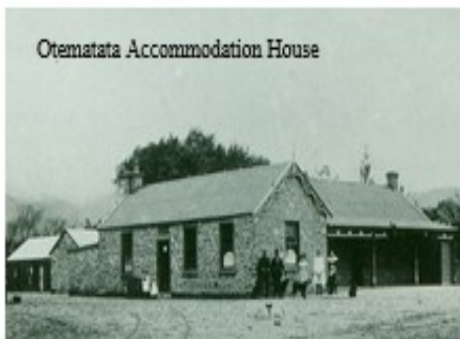
Otematata Accommodation House